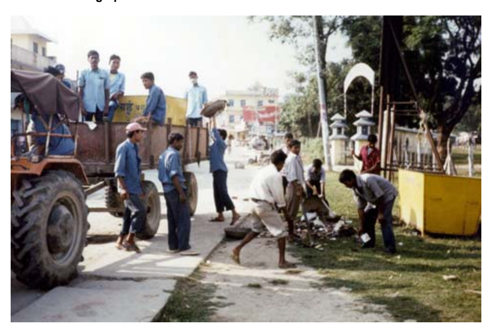
Waste Collection along the Main Road Using a Tractor