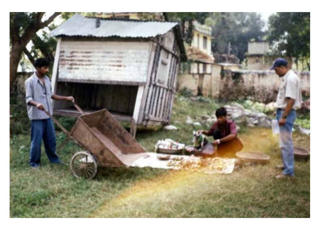
A Hand Cart Used for Waste Collection