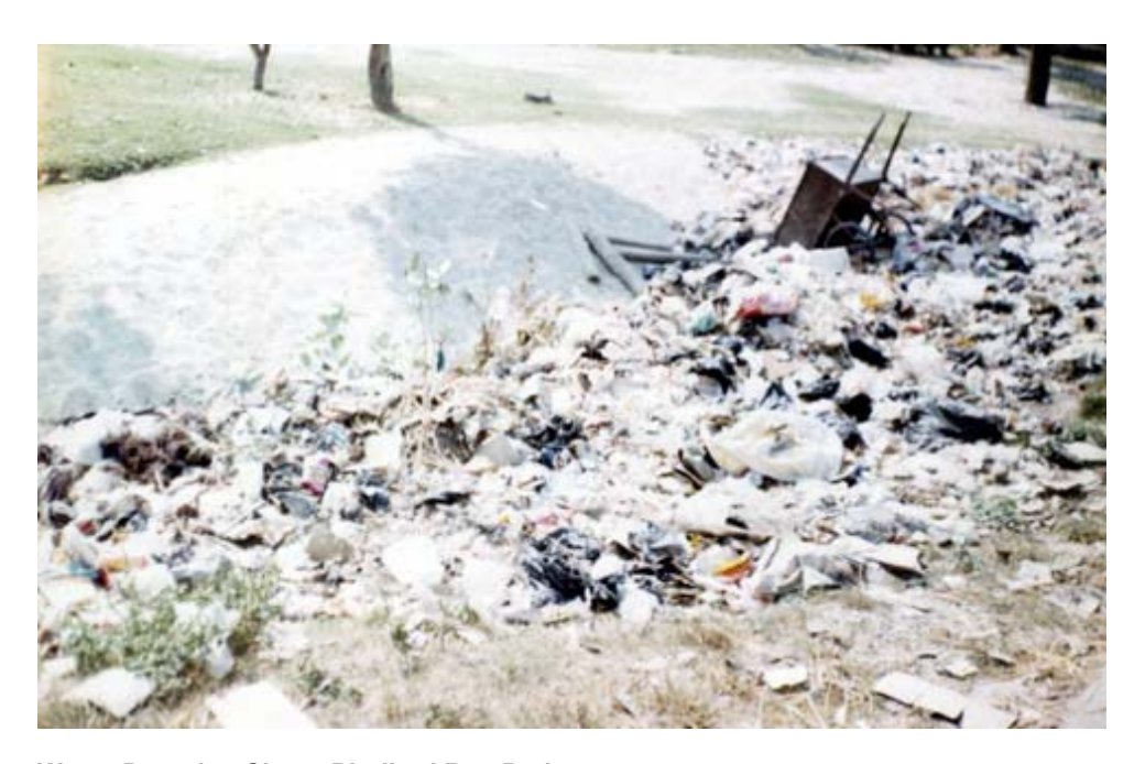
Waste Dumping Site at Phulbari Bus Park