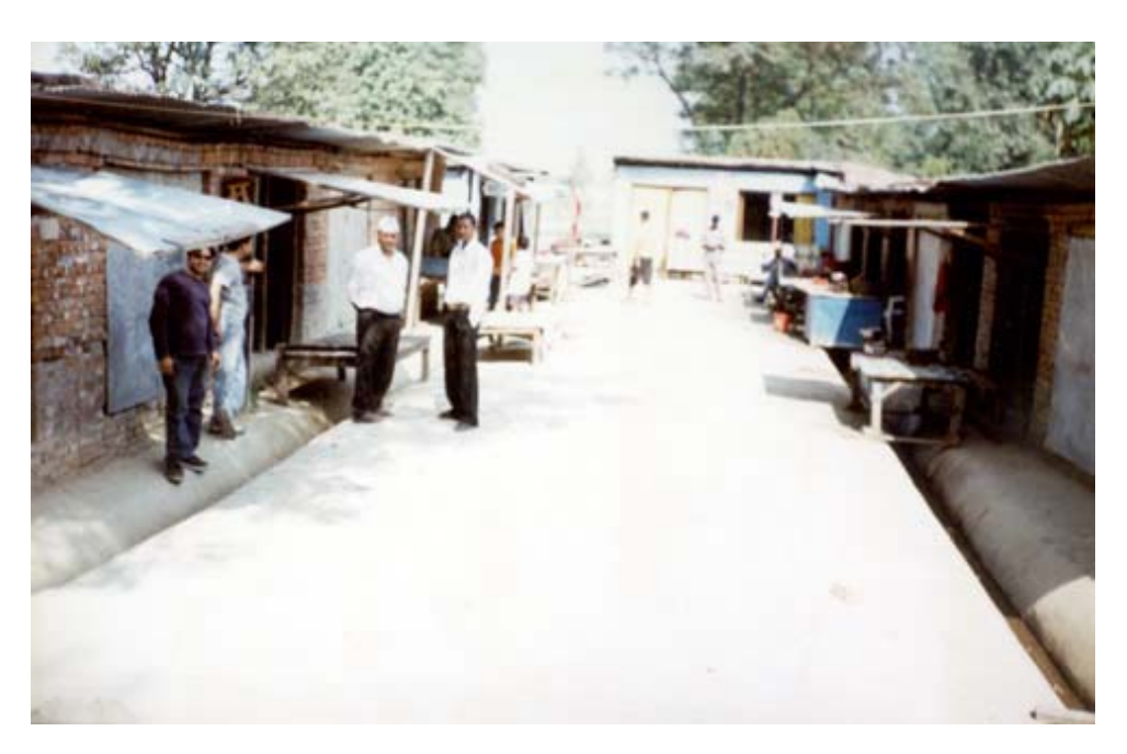
A Clean Meat Market at Phulbari Bus Park