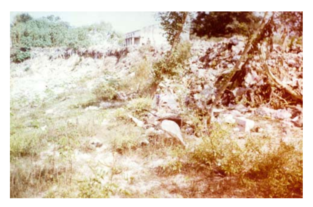
Dumping Site Behind Joshi Katil Hall