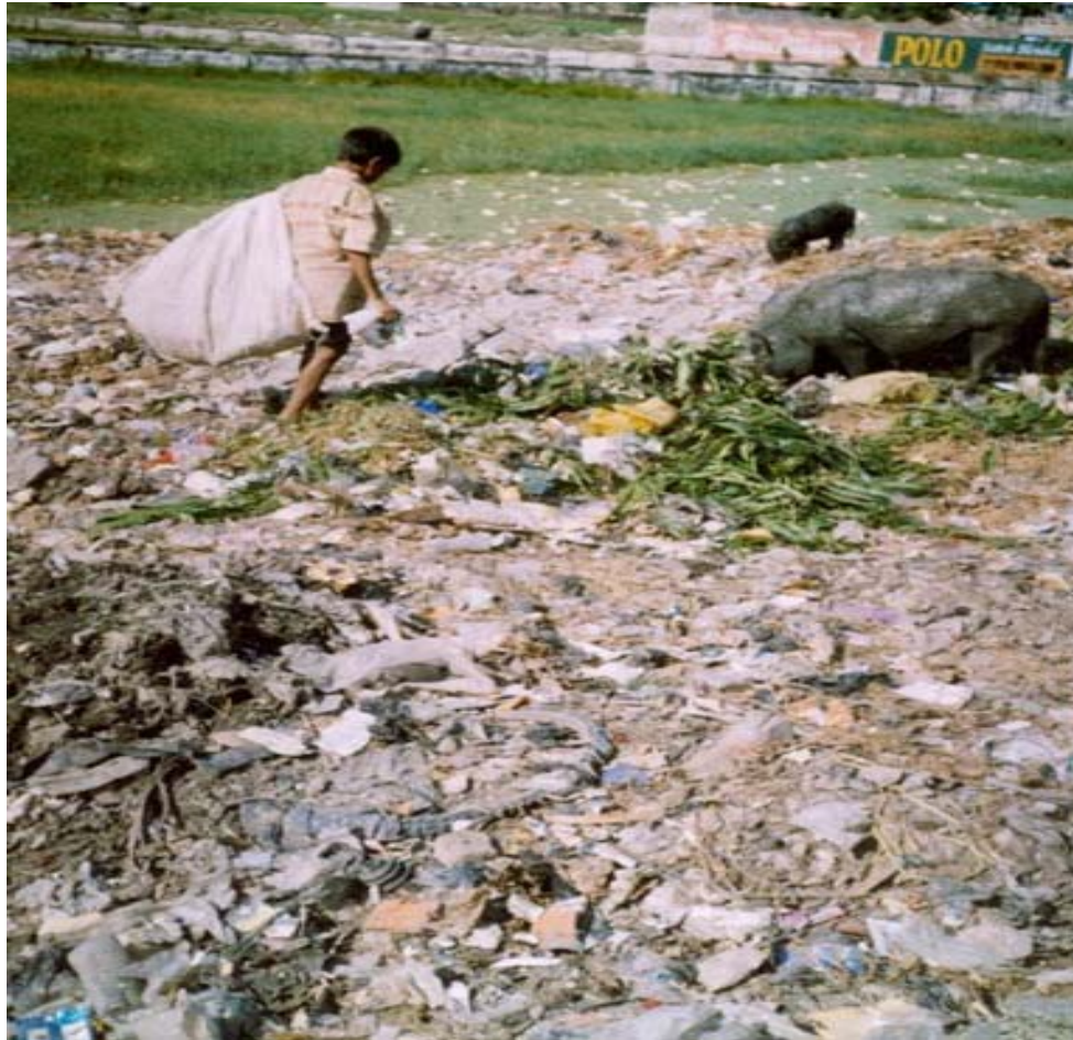
Scavengers at Dumping site