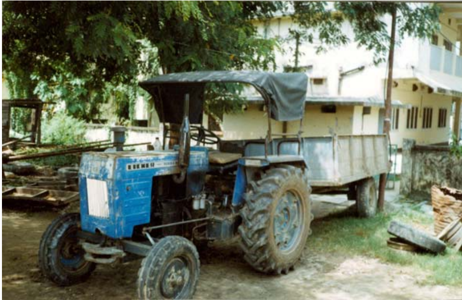
Waste collection vehicle of Birgunj Sub Metropolitan City