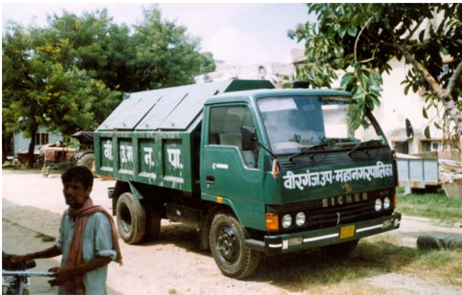
Tipper of Birgunj Sub Metropolitan City