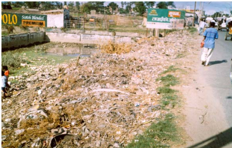
Birgunj Sub Metropolitan City's Current Dumping site