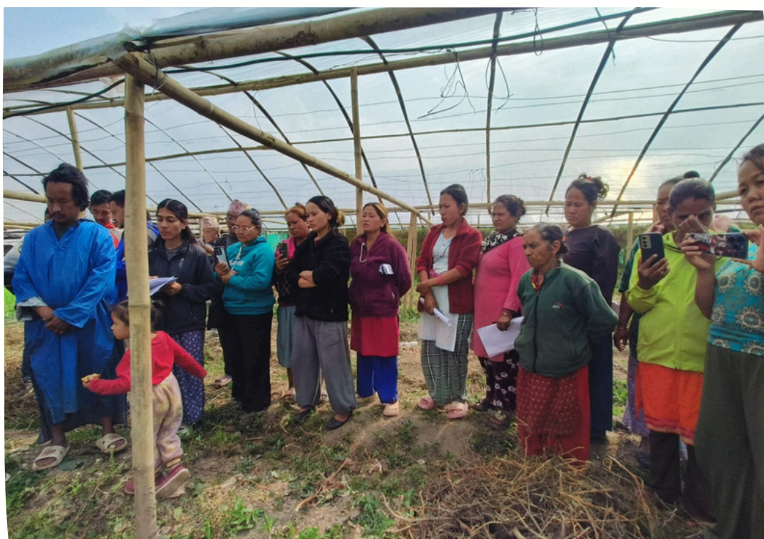
Jholmol preparation training

This can be replicated in other wards of Lalitpur and nearby municipalities such as Godawari, which has peri-urban farming communities with similar climate and soil challenges.