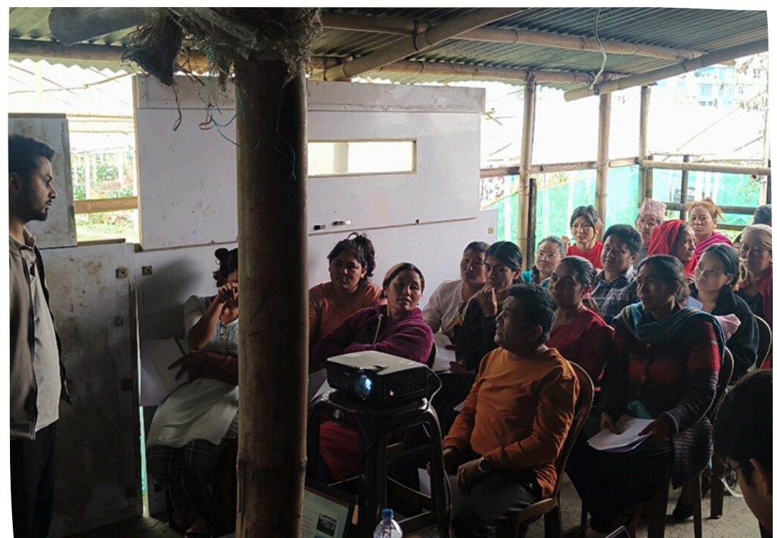
Orientation program to farmers