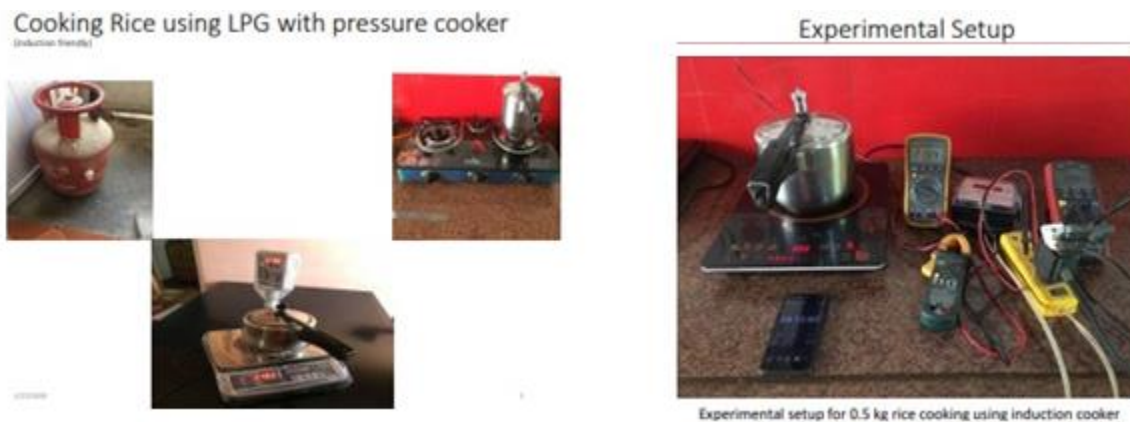
Figure 2: Experimental setup for the rice cooking using different devices at CES/IOE, Pulchowk

Recently we have conducted a simple experiment, at Center for Energy Studies (CES), Institute of Engineering, Tribhuvan University, on cooking of 0.5 kg of rice using LPG, ordinary coil heater, rice cooker, induction and infrared (two burner e-Chulo and one burner) using induction friendly pressure cooker under similar ambient condition. Though the experiment was conducted with limited resources, it has revealed that cooking with induction cooker saves energy and time as well as cost by 42% as compared to LPG. Infrared based cooking performance is comparable with induction cooker. Because of visible smokeless fire and with easy controls infrared based e-Chulo with two burner seems more acceptable to most Nepalese as shown in Table 1.