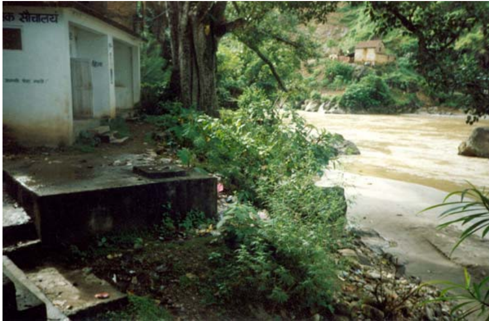
Waste Disposal at Devi Ghat along the Trishuli River