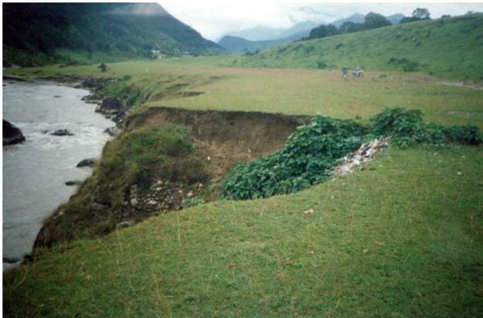
Haphazard Waste Disposal along the Trishuli River