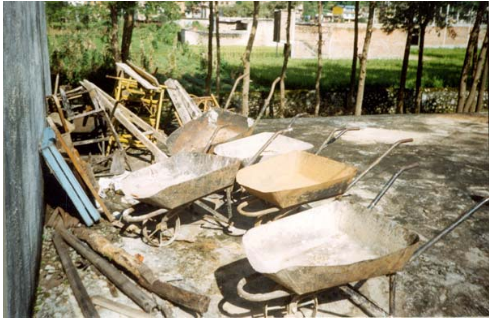
Wheelbarrows Used for Waste Collection