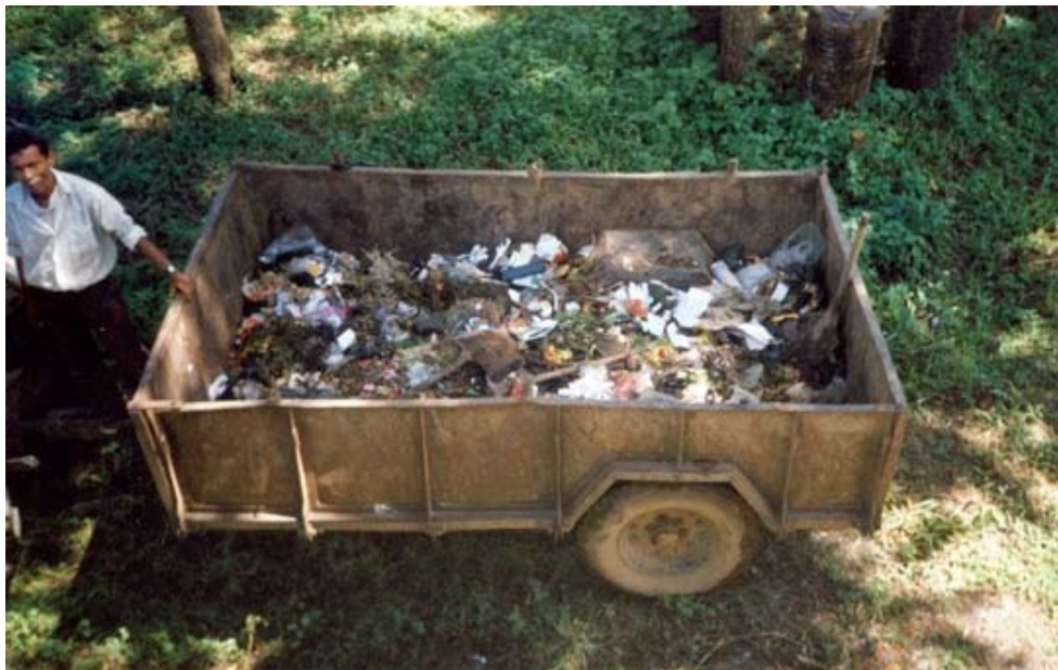
Tractor Trailer Used for Waste Collection