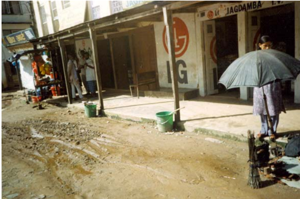
Waste Collection Bins Distributed by Battar Yuva Club