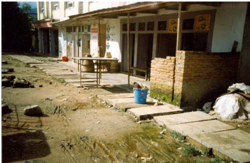
Household Waste Collection Bins