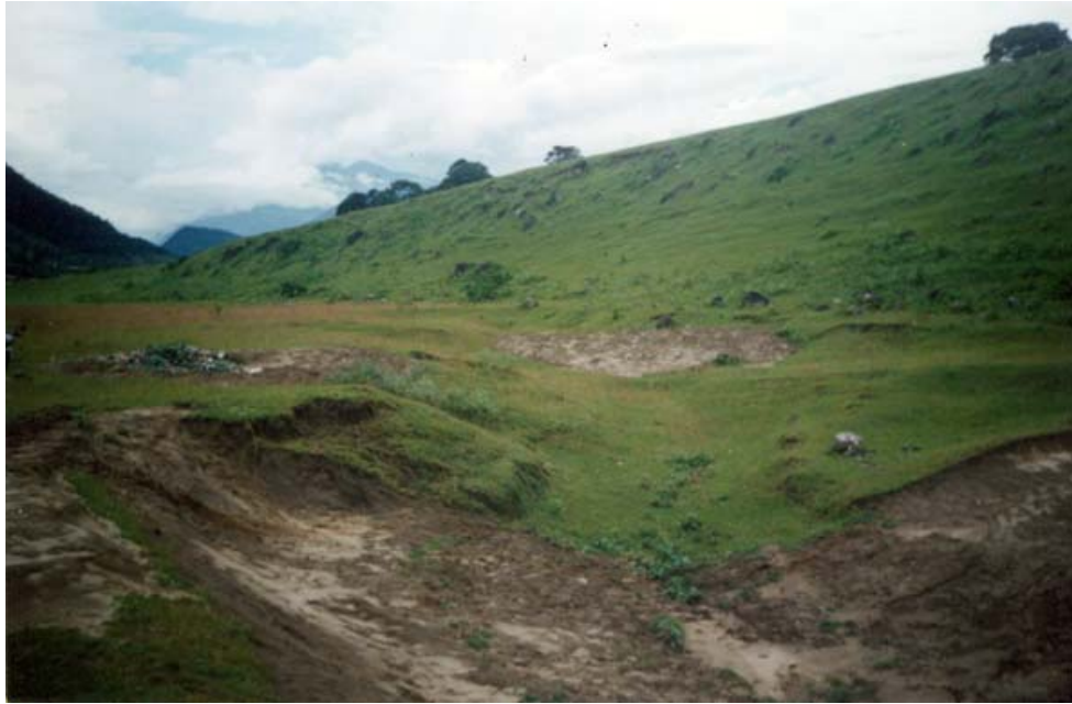
Burial Site for Dead Animals