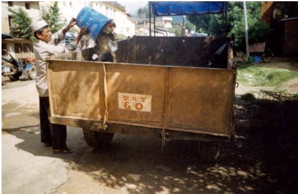
Transfer of Waste from Bins to Tractor