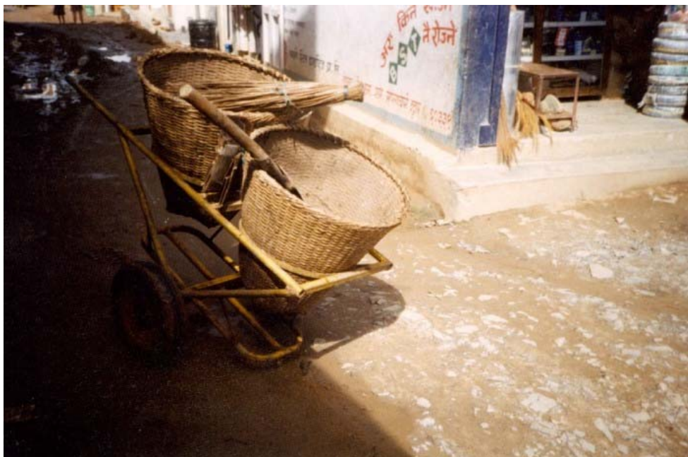
Hand Cart Used for Waste Collection