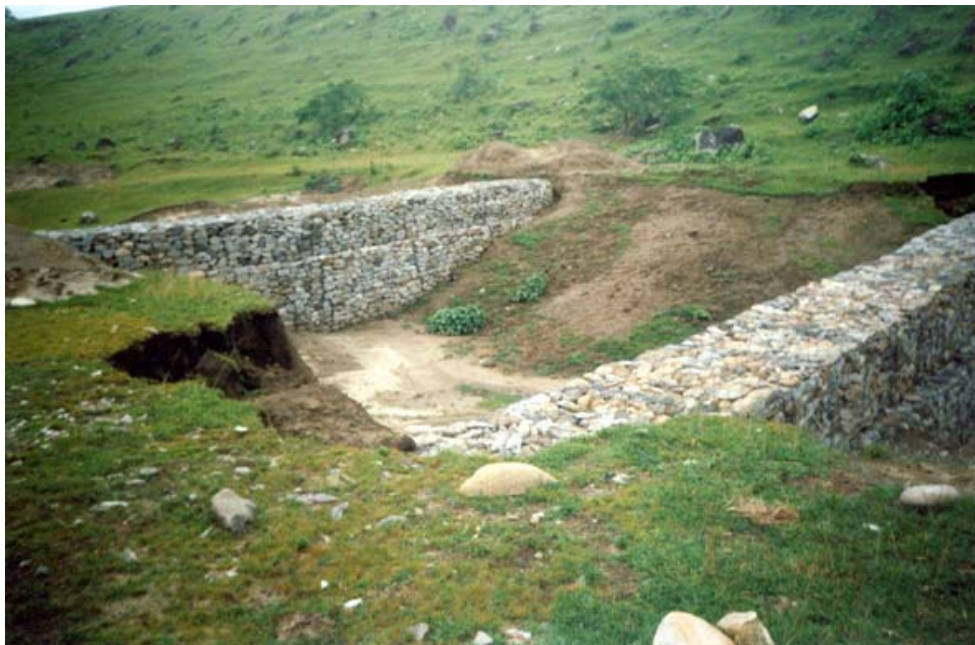
Proposed Landfill Site