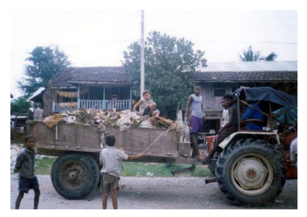
Waste Collection in a Tractor