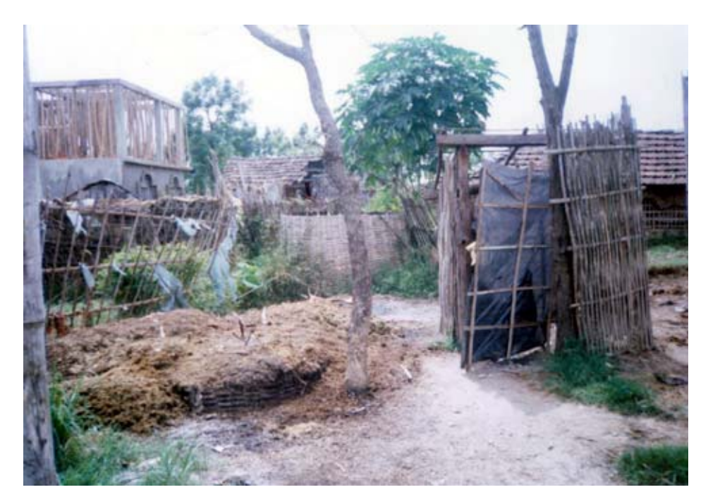
A Compost Pile