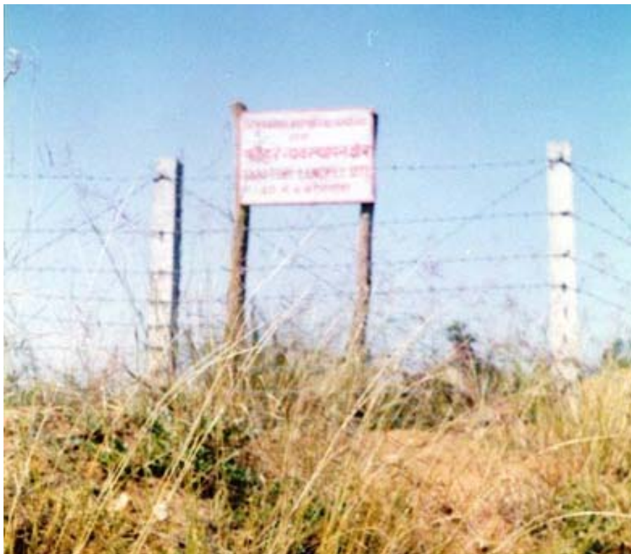
Fencing and Sign at the Waste Disposal Site