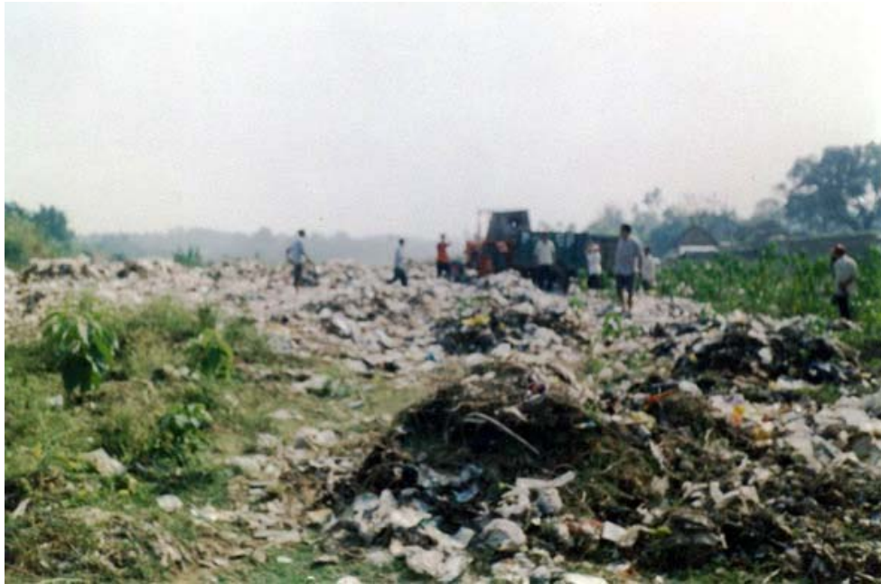
Municipality's Waste Disposal Site