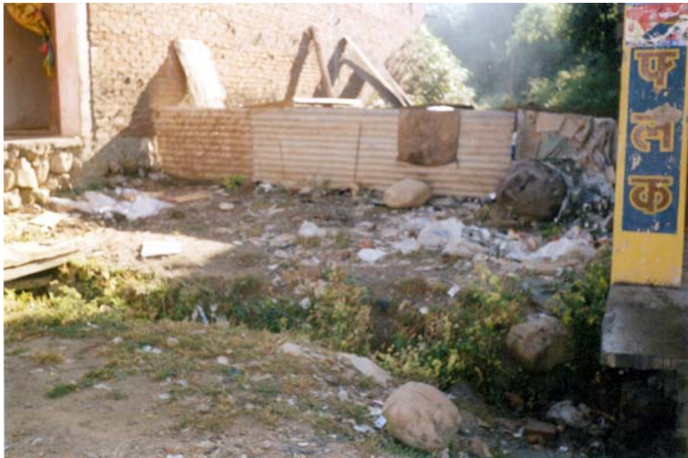
Waste Disposal in Drains