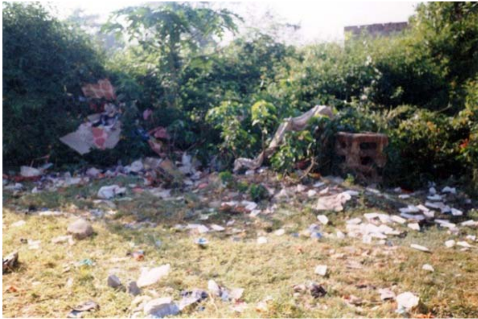
Haphazard Waste Disposal