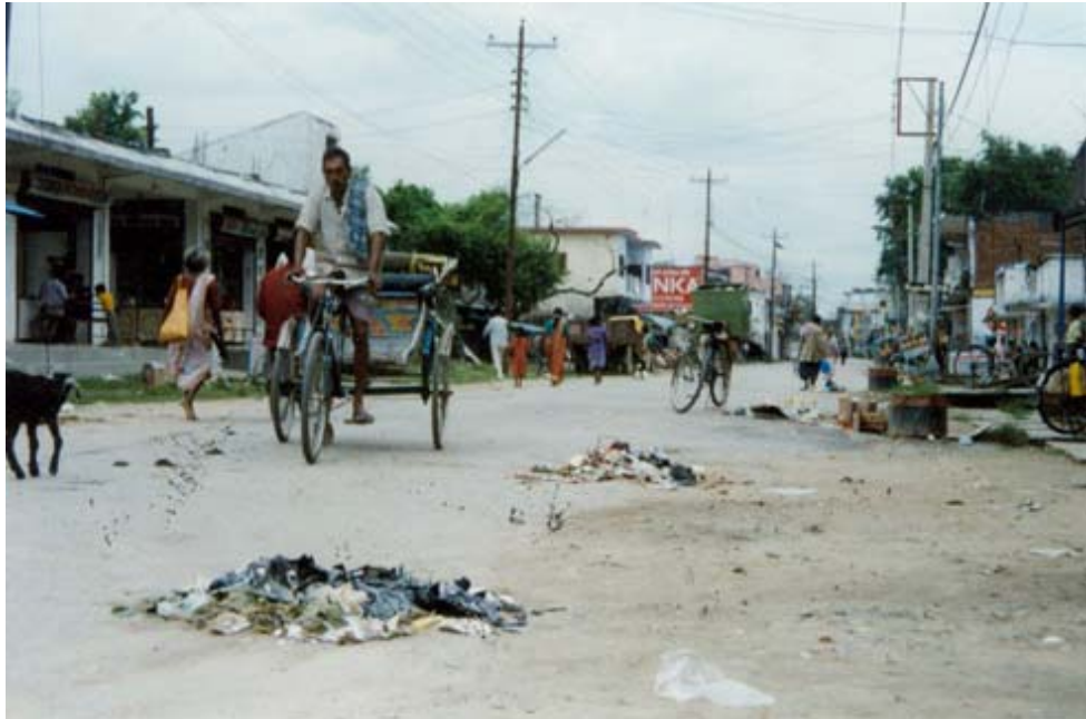
Waste Piles Created After Street Sweeping