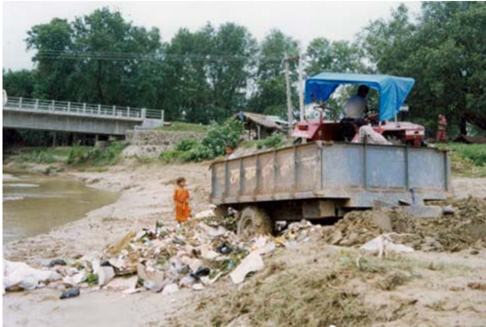
Unloading Waste from the Tractor at the Dumping Site