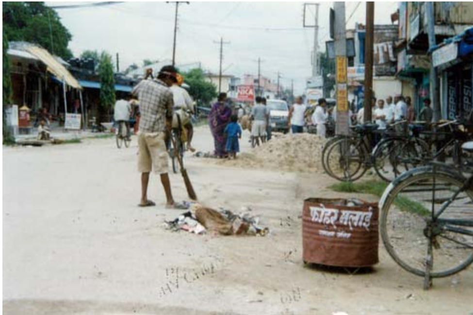
Street Sweeping to Form a Waste Pile Next to a Collection Bin