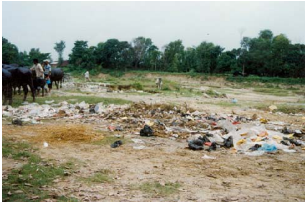
Waste Dumping Site