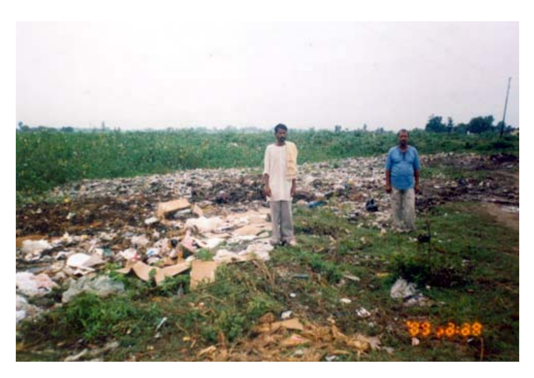
Waste Disposal Site