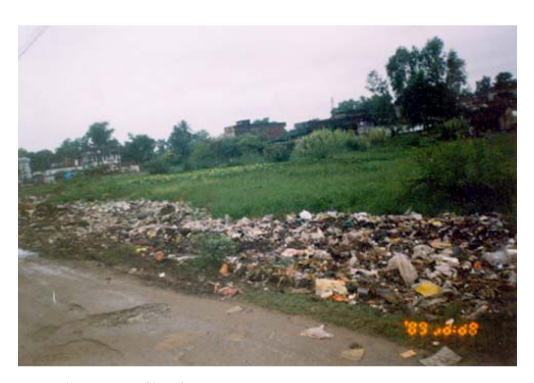
Waste Disposal by the Side of the Road