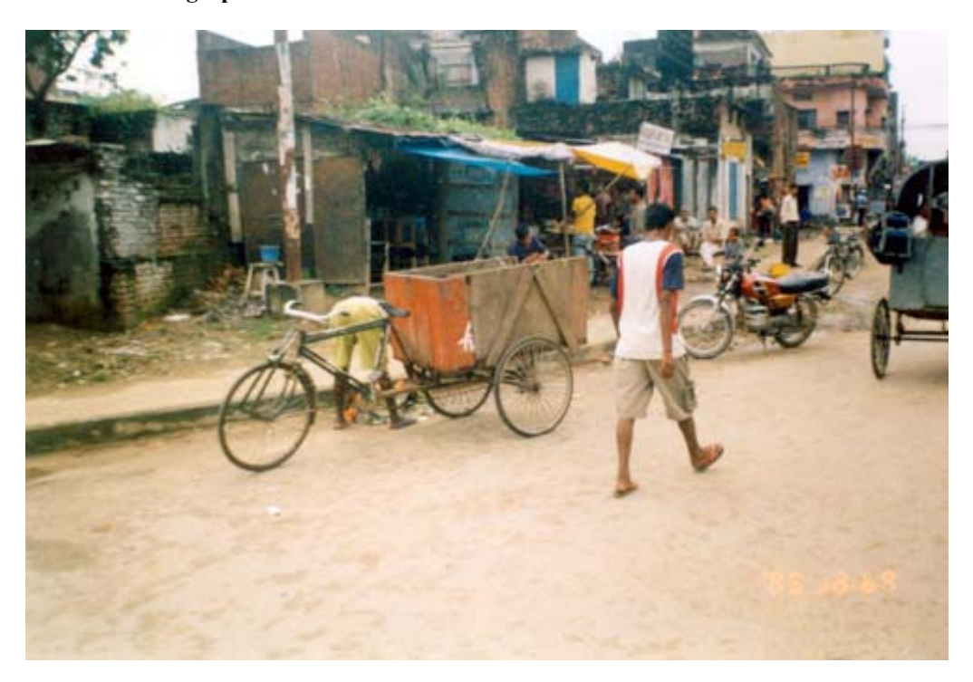
Waste Collection Using a Rickshaw