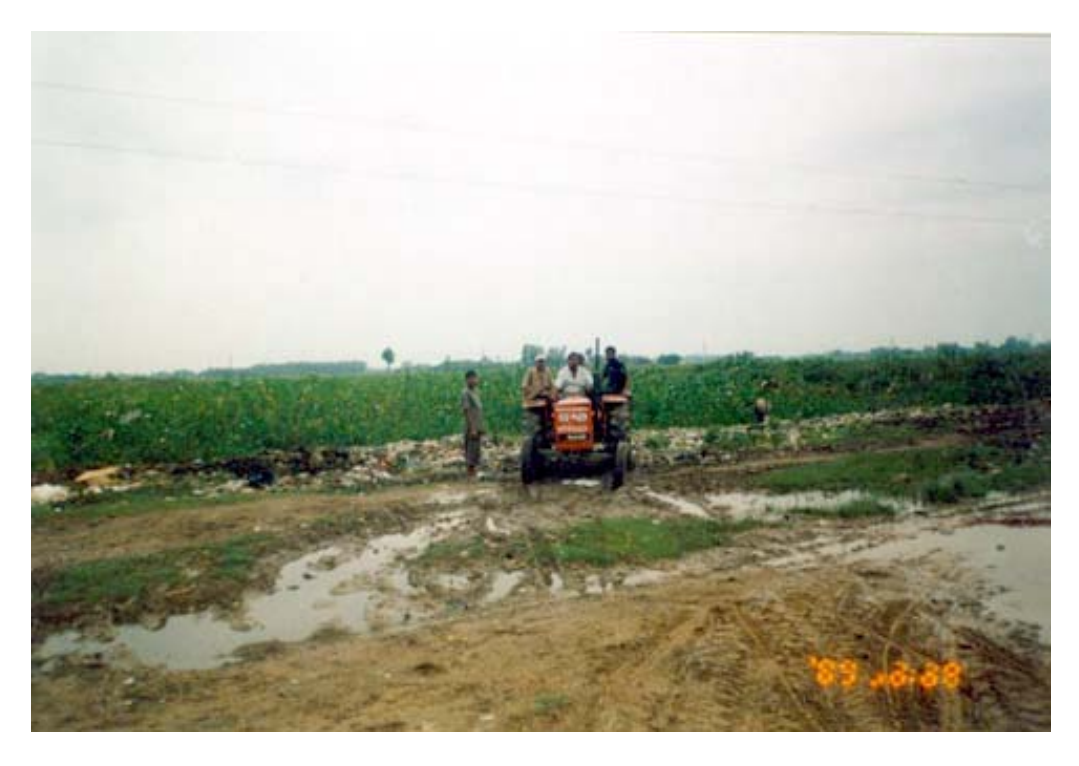
Tractor Taking Waste to the Disposal Site