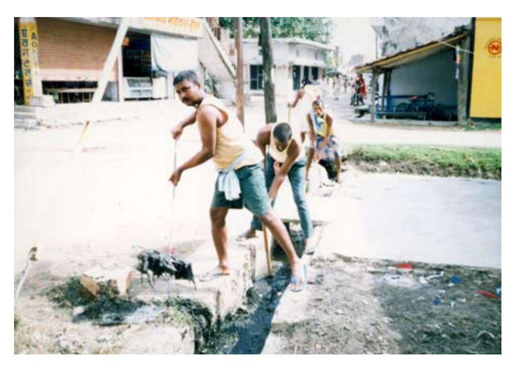
Cleaning of Drains Clogged by Solid Waste