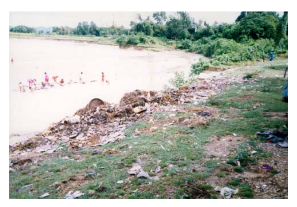
Women Washing Clothes Near Waste Dumping Site