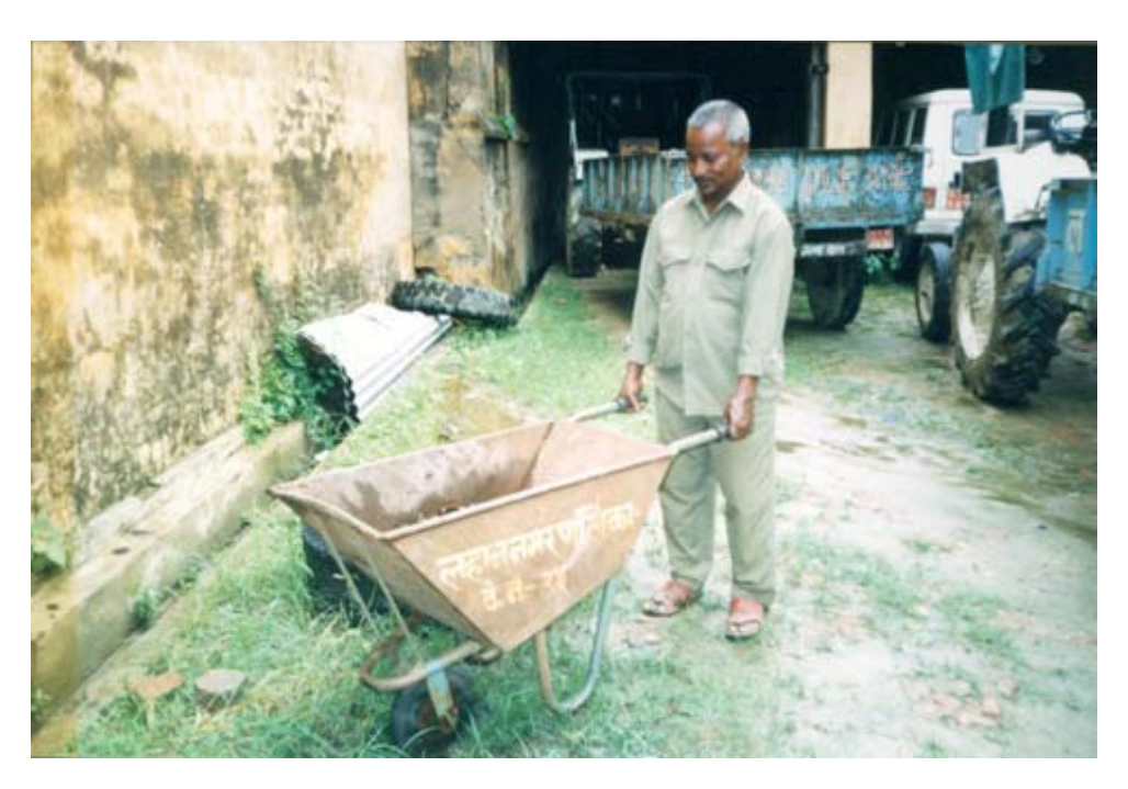
Hand Cart and Tractors Used for Waste Collection