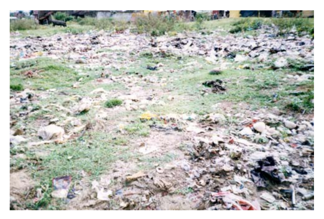
Waste Dumping Site at Khuti Khola