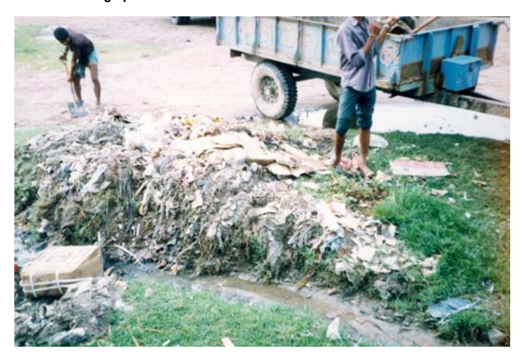
Waste Collection Using a Tractor