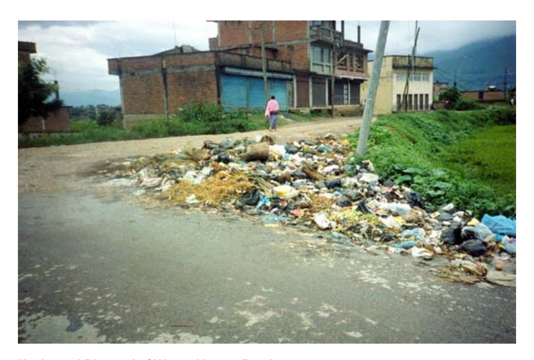
Haphazard Disposal of Waste Along a Road