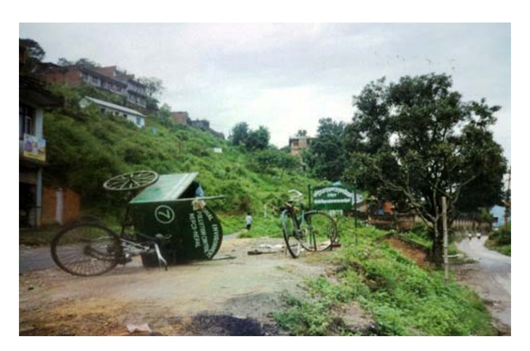
A Rickshaw Used for Collecting Waste