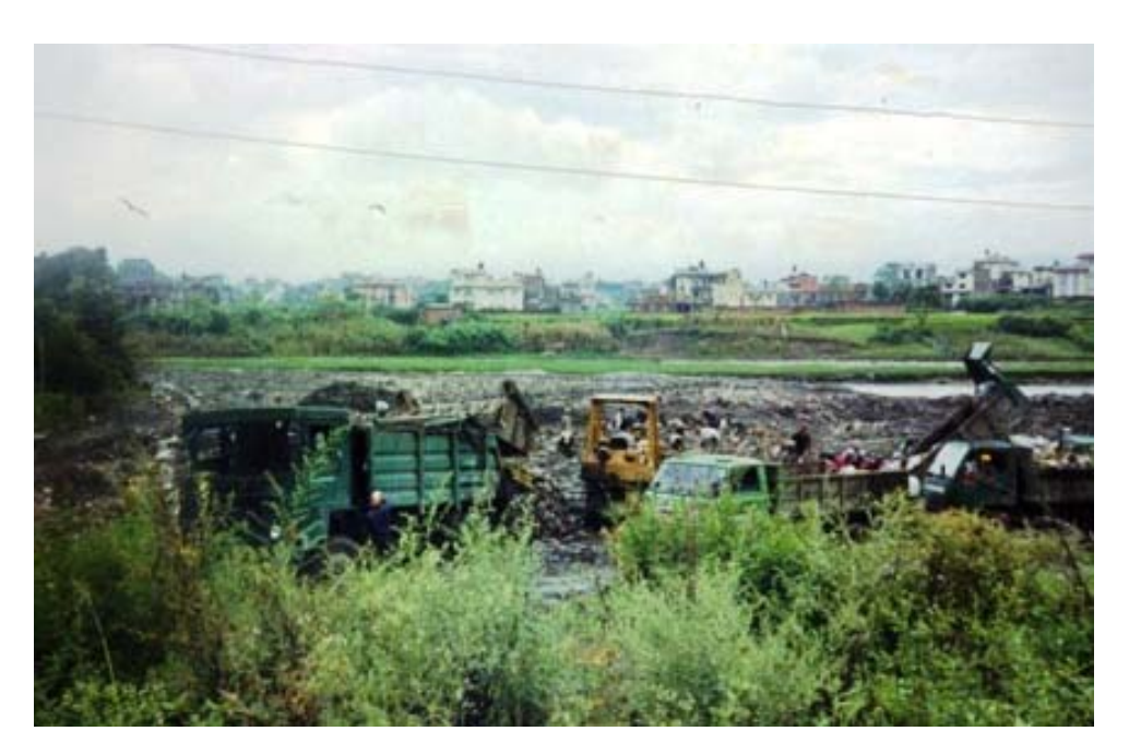
Waste Being Dumped at Balkhu Dump Site Operated by Kathmandu Metropolitan City