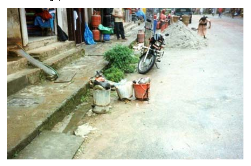
Waste in Bins Waiting for Collection