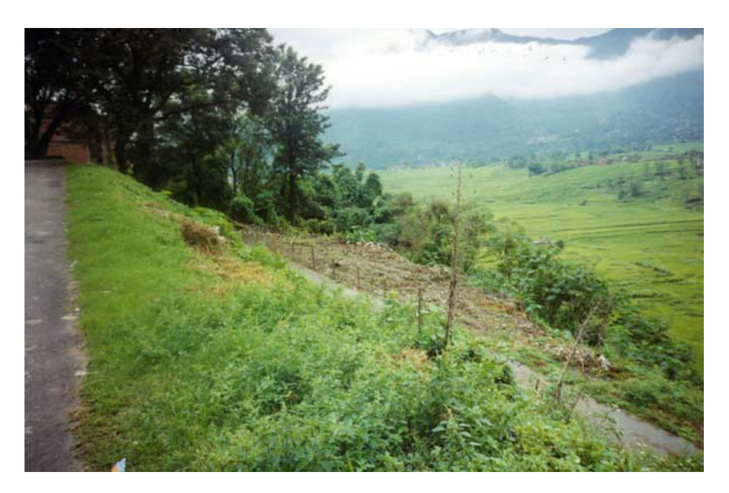
An Old Dump Site