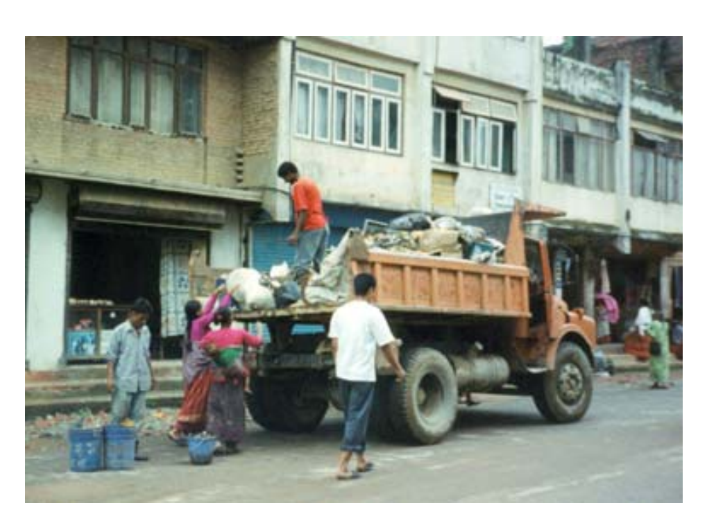
Door-to-door Collection of Waste in Tipper