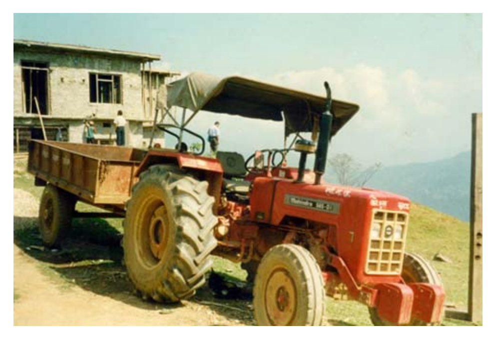
Tractor Used for Waste Collection and other Purposes