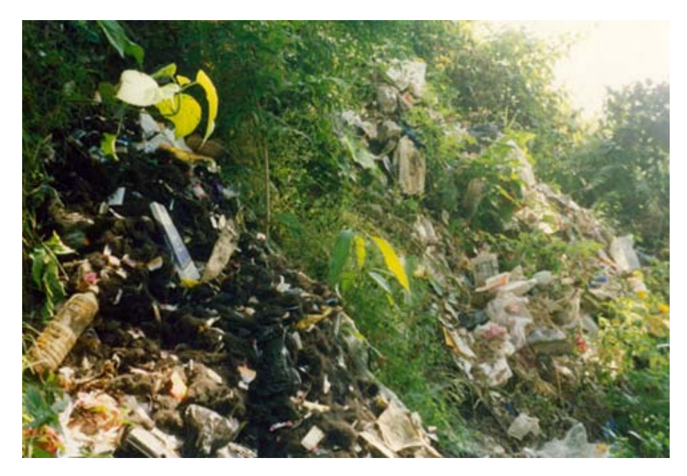
Waste Disposal Site above a Drinking Water Source