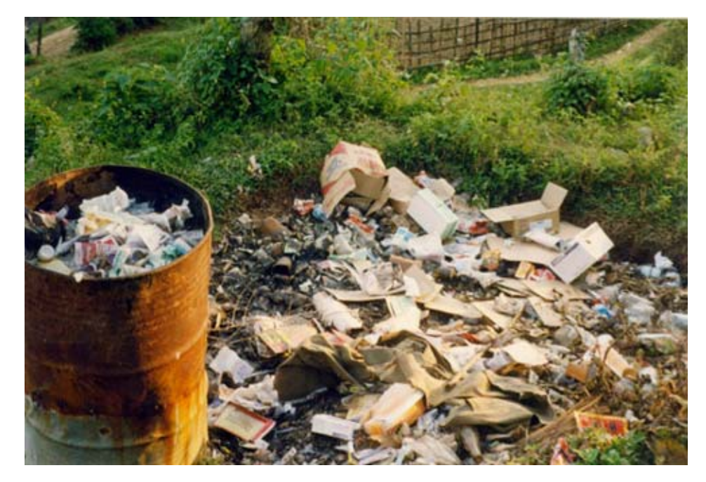
Burning and Disposal of Medical Waste Within the Hospital Premises