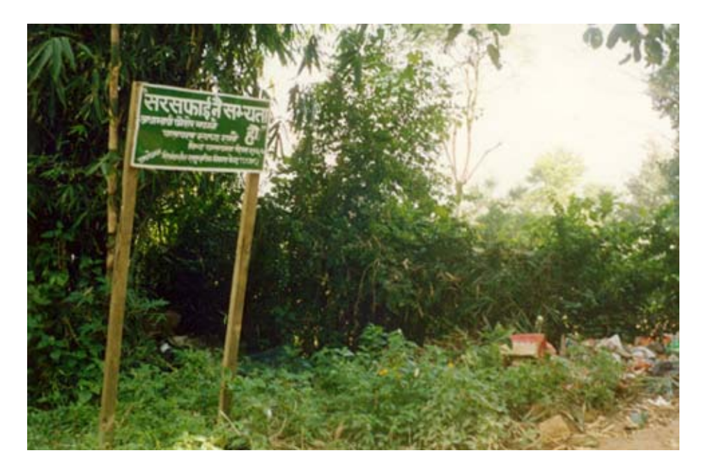
Board to Raise Awareness no Waste Management