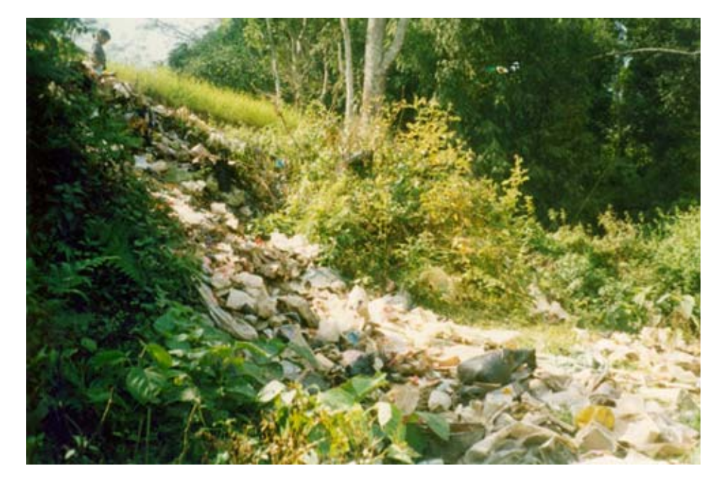
Waste Disposal Site Near the Municipality Building