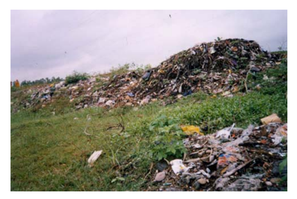
Waste Dumping Site at Chapper Talla