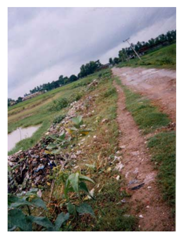
Waste Dumping Along the Road at Chapper Talla