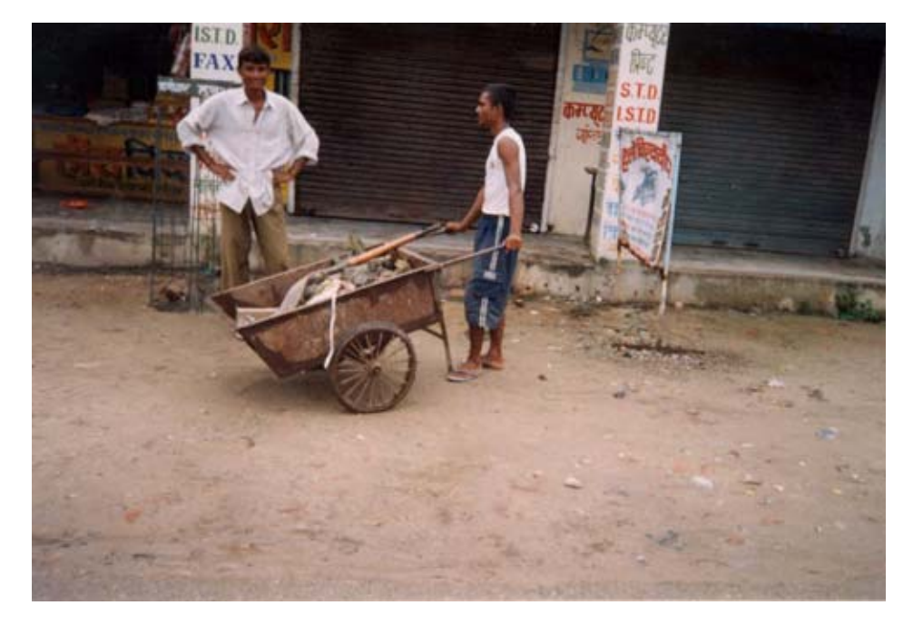
A Hand Cart Used for Waste Collection