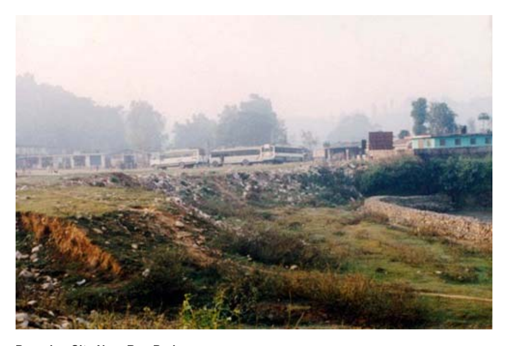
Dumping Site Near Bus Park