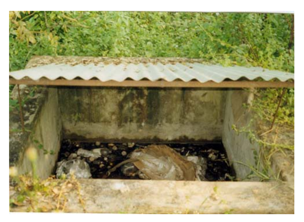
Disposal of Liquid and Solid Medical Waste in a Pit