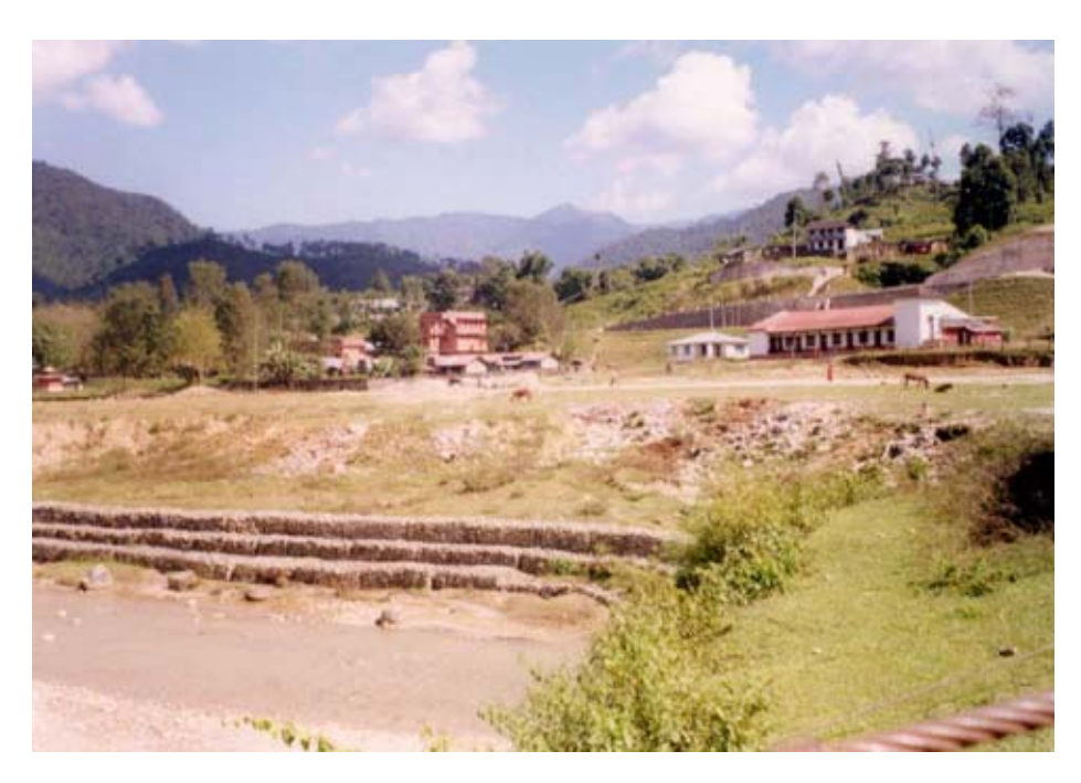
Dumping Site on the Banks of Gwang Khola