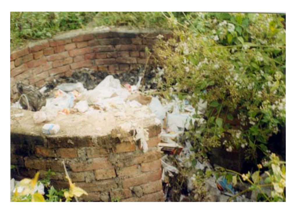
Medical Waste Disposal and Burning at Sindhuli Hospital