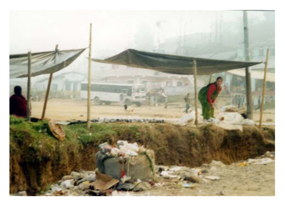
Overflowing Concrete Container