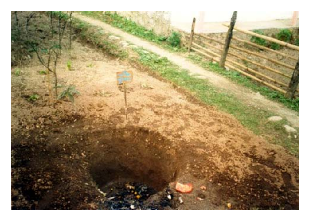
Compost Pit in Private Garden