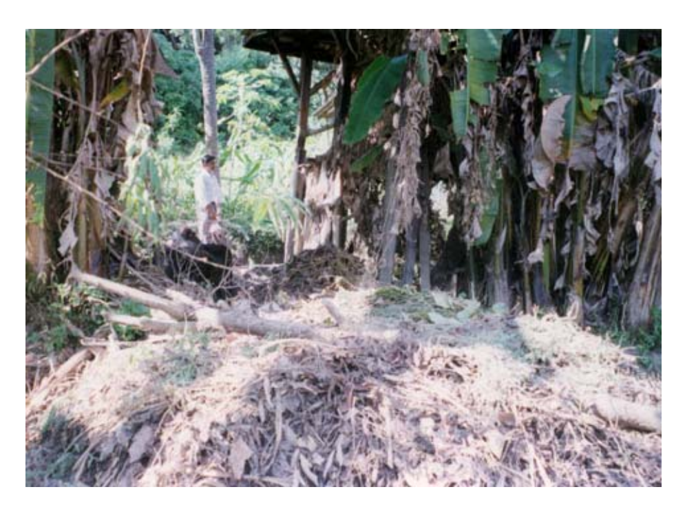
Compost Pile for Agricultural and Kitchen Waste