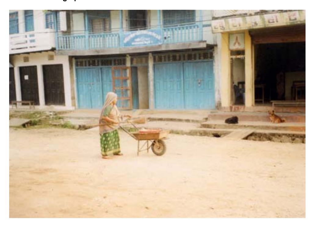
Sweeper with Wheelbarrow