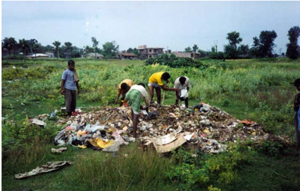
Sorting of Waste At Dump Site