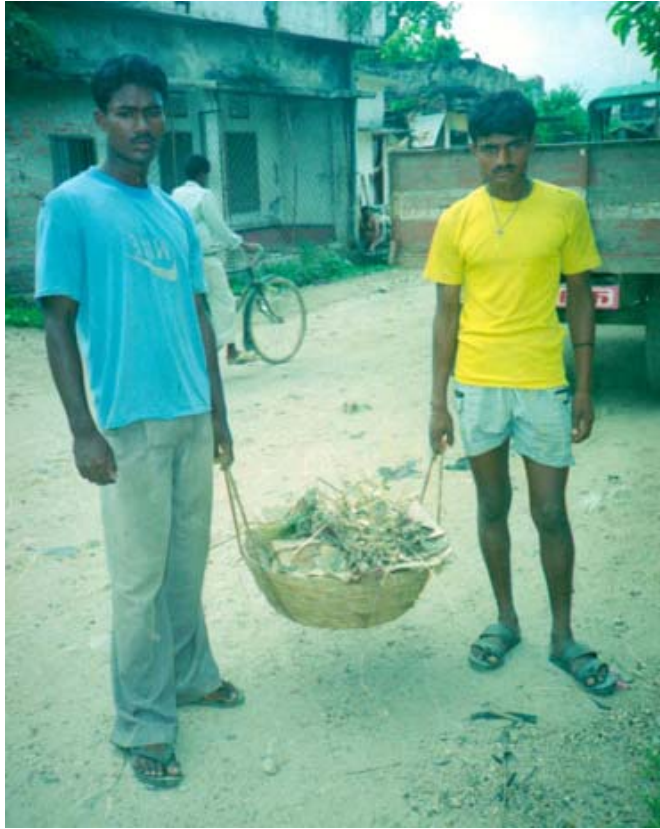
Waste Collection Using Traditional Basket