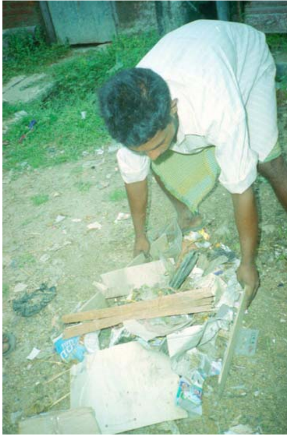
Waste Collection Using Pieces of Wood