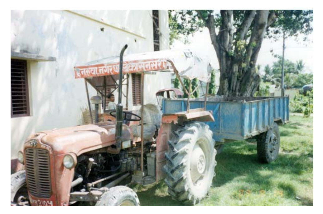
Tractor Used for Waste Collection