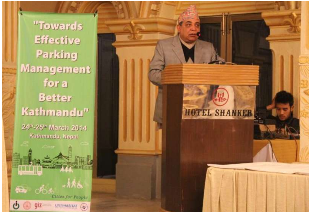
Figure 2: Opening Remarks from Secretary of Ministry of Physical Infrastructure and Transport