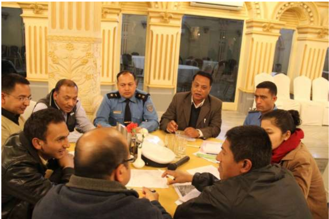
Figure 6: Group Session on the Management of Parking

The high level panel discussion was followed by group work on parking management issues. The participants were divided into five groups and assigned to discuss existing parking problems and explore possibilities of parking management in five key areas of Kathmandu: Thamel, Durbar Marga, Pako sadak, Dharmapath and Sukrapath. Some of the key problems identified were long duration parking in on-street, double parking, queuing for parking etc. In the long term, vehicle free zone in the core areas was suggested. Parking infrastructure such as road marking on the parking site, signage of parking and effective pricing were suggested. The groups suggested having parking pricing structure based on the occupancy of vehicles during peak hour, off hour, week day and weekend. For the parking management underground parking in the suitable places nearby was proposed by most of the groups.